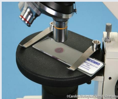
B. Microscope Slide